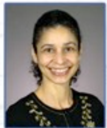
ELISA DEKANEY COLLEGE